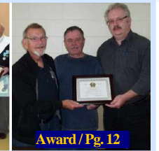
Award / Pg. 12