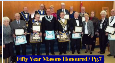
Fifty Year Masons Honoured / Pg.7