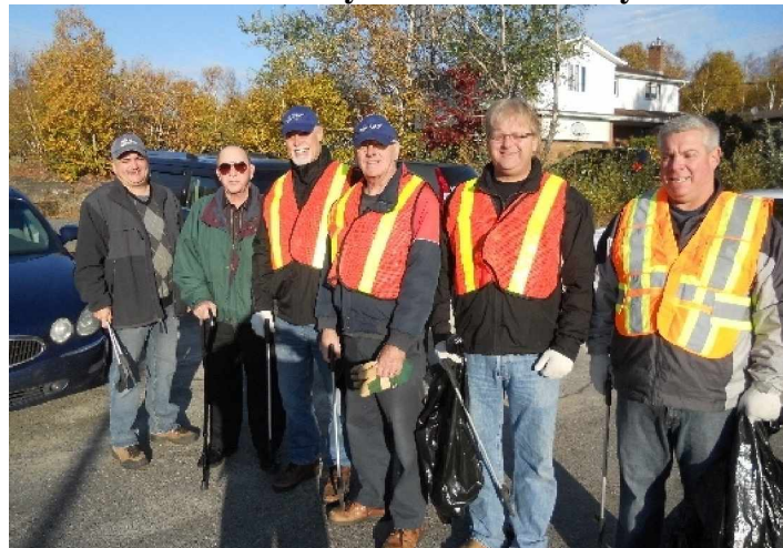
October 13 th 2012 Friendship Lodge members held their fall cleanup on Long Lake Road for the city adopt a road program.