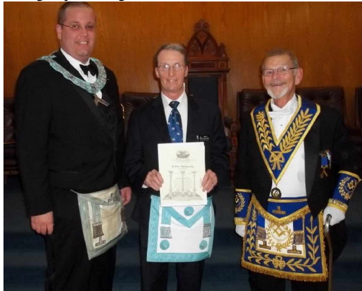
The brethren welcomed visiting Grand Lodge Officers.