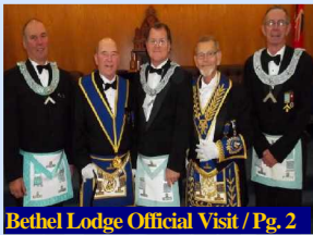
Bethel Lodge Official Visit / Pg. 2