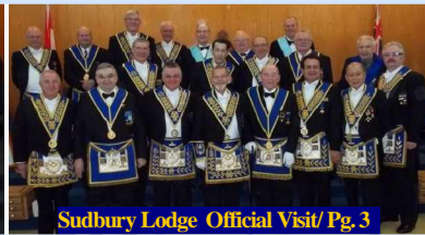
Sudbury Lodge Official Visit/ Pg.3